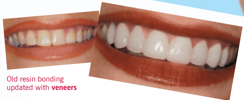
Old resin bonding updated with veneers

All of this takes quite a bit of artistry, and so we work hand-in-hand with skilled lab technicians to ensure your new smile is natural looking. There are three indices which determine a perfect match for your smile: hue, value, and chroma. The color or hue must match, but so must value or lightness, and chroma which is the saturation or intensity of color.